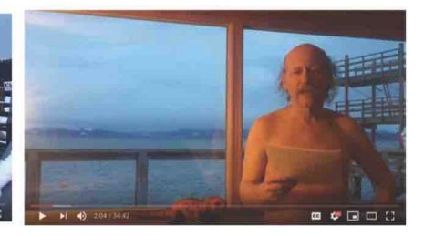
A "naked darwinist" reads his Bioko paper